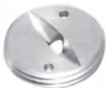
CTC Fan Spray Nozzle